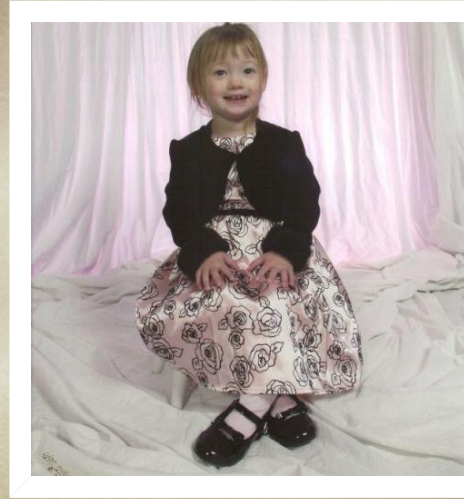
Aren't I pretty?