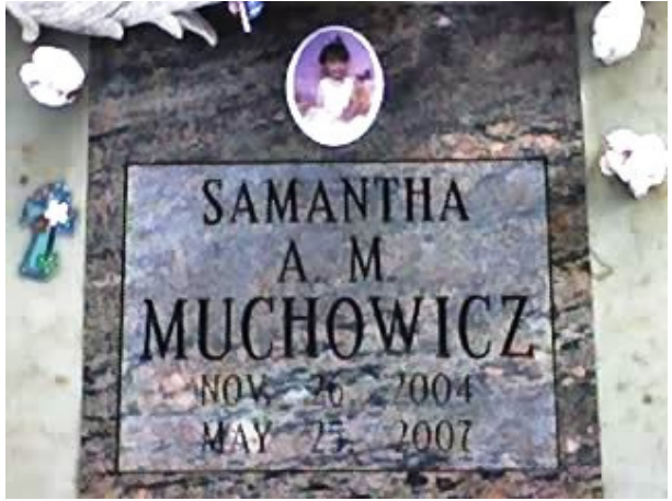
Sam's beautiful headstone