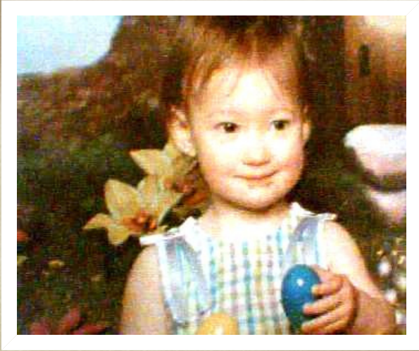
MY Easter eggs!